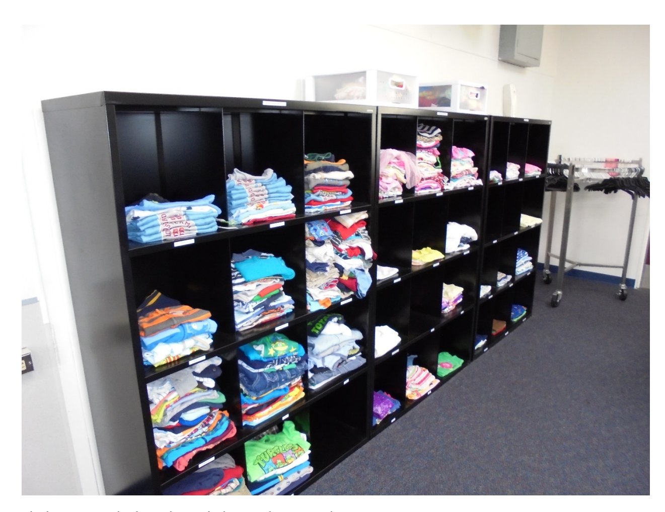
Clothes are stacked neatly on shelves in the CARE Closet.